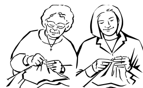
Prayer Shawl Ministry

We invite you to join the Prayer Shawl Ministry here at Grace Lutheran Church.