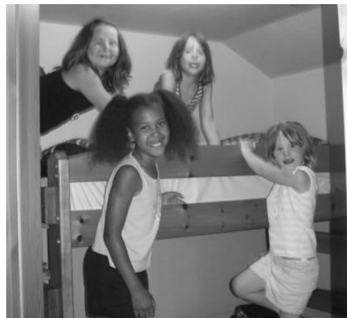
The girls checking out the sleeping area!