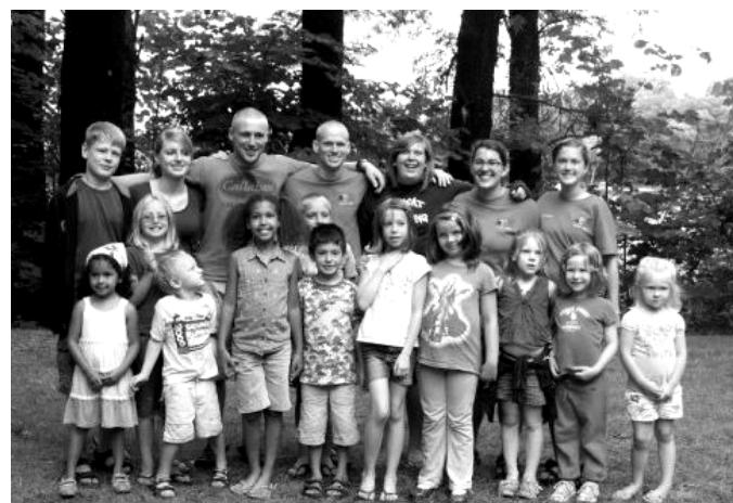
Kids attending camp and the Camp Counselors